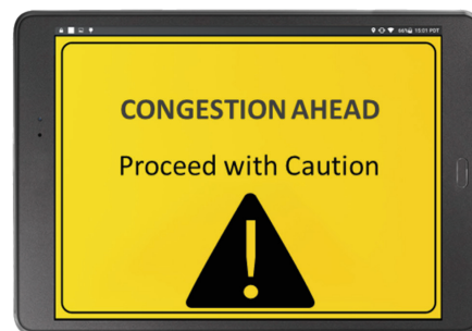
Figure 2. Screen shot. Congestion warning.