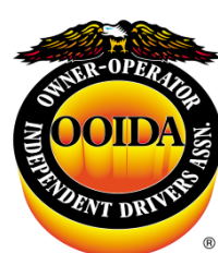
Figure ES-1. Illustration. Organizations and agencies participating in the National Coalition on Truck Parking.

The results and findings of the regional meetings conducted as part of this effort are suggestions and proposals received by participants at the meetings. As such, they should not be interpreted or viewed as recommendations of USDOT, FHWA, or the associations that participated in the National Coalition on Truck Parking.