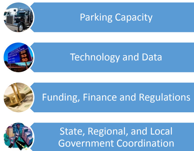
Figure 2. Diagram. Topic areas addressed at the regional meetings.

At the regional meetings, participants shared their ideas on the following four discussion areas, which were identified during the November, 2015 Coalition kick-off meeting: