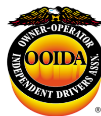
Figure 4. Illustration. Organizations and agencies participating in the National Coalition on Truck Parking.