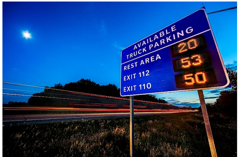
Figure 8. Photo. Truck parking information and management system on I-94 in Michigan.